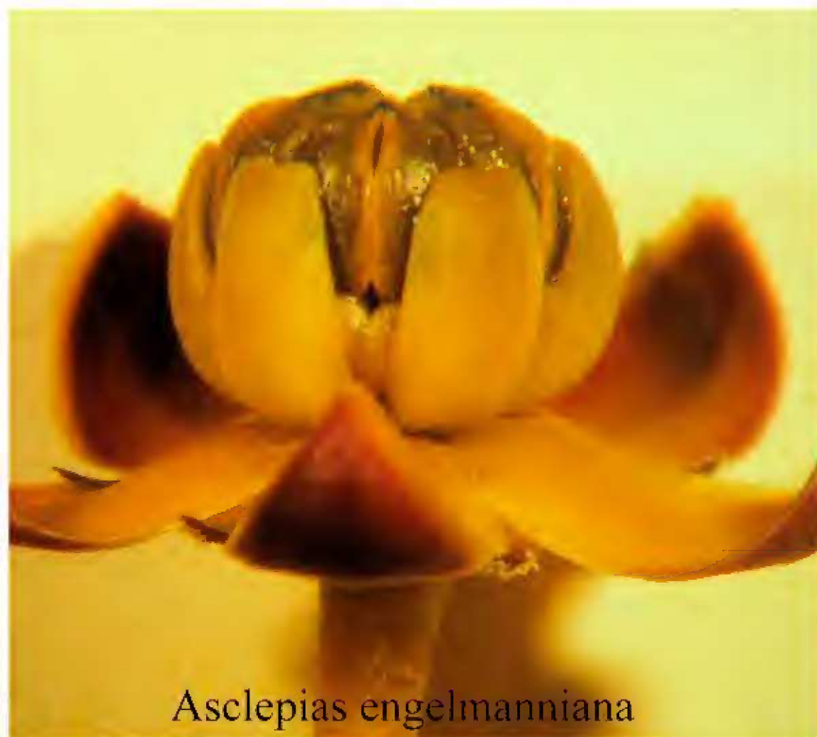
Figure 2. Asclepias engelmanniana flower from Cimarron Co., OK. Note the additional flaring of the anther wings along the arch, besides the flaring at the base.